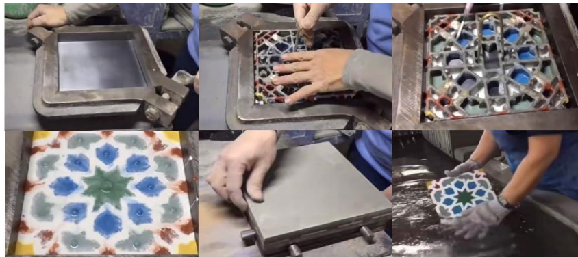
Figure 3: Production Process of Minnan-Style Decorative Tiles

The production process of Minnan-style decorative tiles generally consists of seven steps: raw material preparation, design modeling, clay shaping, carving or printing, drying and curing, firing, and glazing and decoration, see Figure 3. All these steps are performed manually, which is time-consuming and inefficient. The production methods of Minnan-style decorative tiles typically employ traditional handicraft techniques. Although these methods may be considered relatively outdated in some respects, they represent a form of expression with a long history and rich cultural heritage. While these manual production methods are more time-consuming and labor-intensive compared to modern industrial manufacturing, they impart unique cultural and artistic value to the decorative tiles.