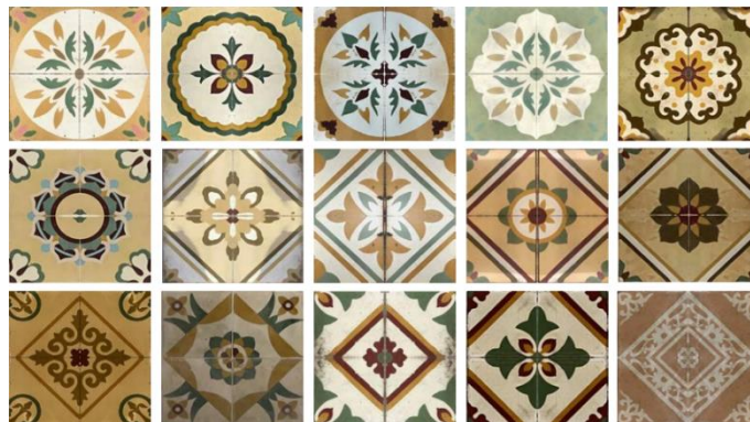
Figure 1: Patterns and Motifs of Minnan-Style Decorative Tiles

tiles is unique, requiring advanced craftsmanship and a profound understanding of traditional culture. These tiles, with their abundant patterns and motifs, vividly reflect the distinctive cultural heritage of the Minnan region.