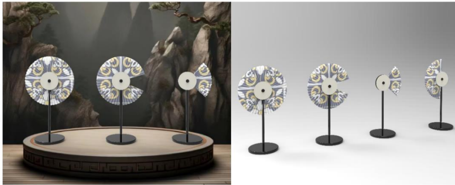
Figure 5: Cultural Creative Product Design

inheritance of traditional culture with modern market demands, emphasizing innovation, personalization, and storytelling to attract a broader audience.